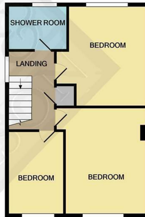
1ST FLOOR APPROX. FLOOR AREA 441 SQ.FT. (41.0 SQ.M.)

TOTAL APPROX. FLOOR AREA 1465 SQ.FT. (136.1 SQ.M.)