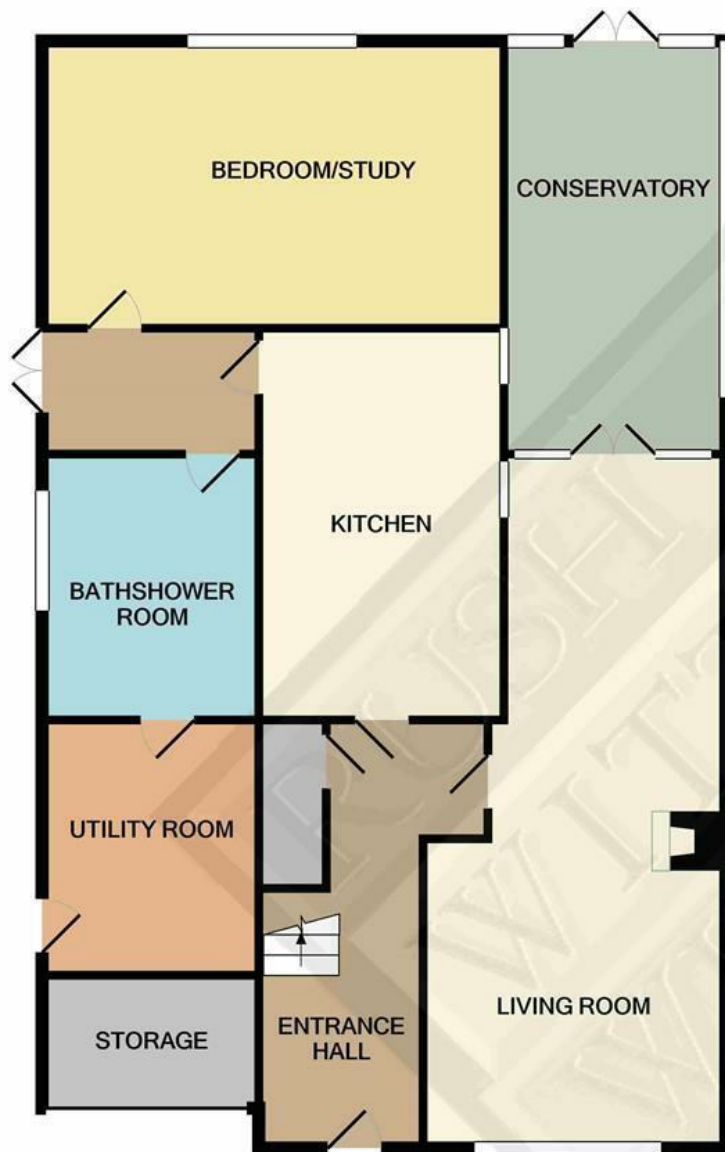
GROUND FLOOR APPROX. FLOOR AREA 1023 SQ.FT. (95.1 SQ.M.)